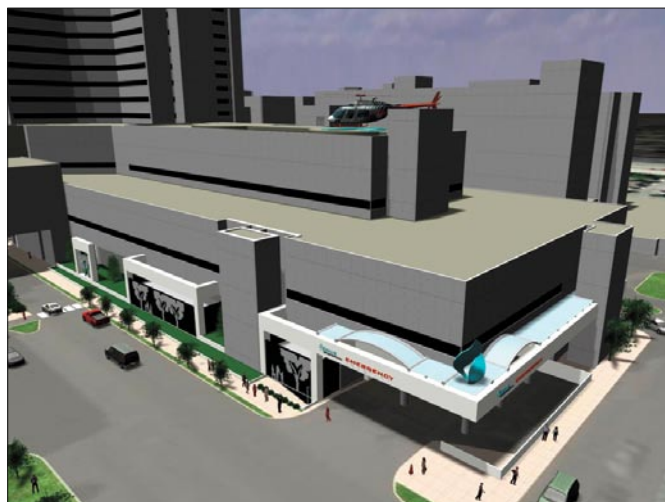
Figure 1. Artist's rendition of the expanded emergency department at Baylor University Medical Center.

Our patients were foremost in the planning of the new ED. The first thing one notices in our new department is "the quiet."