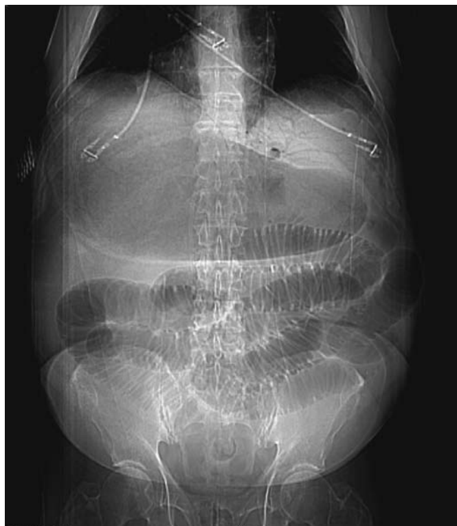
Figure 1. CT scout image showing massive gastric dilation.

The patient was resuscitated with intravenous fluids and taken emergently to the operating room, where a midline laparotomy was performed. The small bowel was distended but viable. A single adhesion in the right lower quadrant causing torsion of the small bowel was released, but no other points of obstruction were found. A nasogastric tube was placed in the emergency department but did not function until it was repositioned in the operating room. Five liters of brown gastric content were suctioned from the nasogastric tube in the operating room. After decompression of the largely distended stomach, patchy areas of dark ischemic tissue along the greater curve